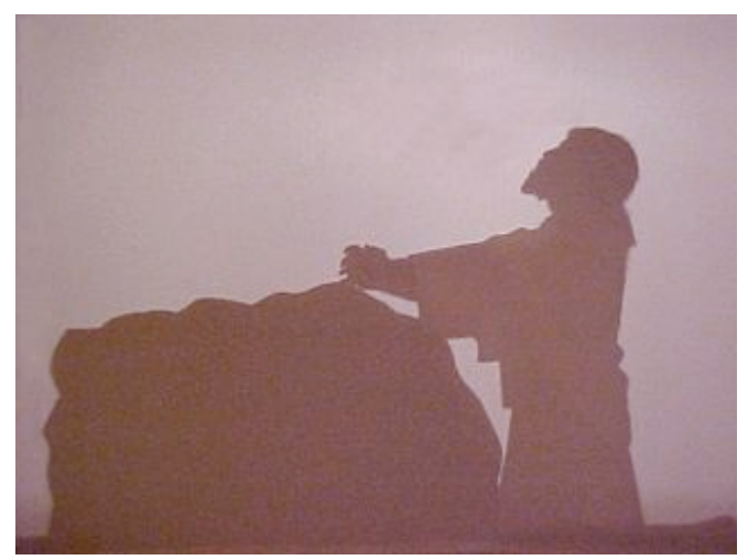
Scene 2: Jesus is Arrested Hymn "Glory Be to Jesus" LBW No. 95, verses 1,2,3 Text: John 18:2-12