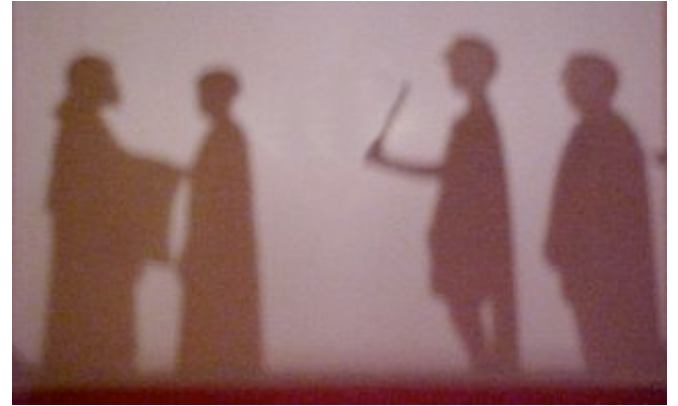
Scene 3: Jesus Is Brought Before Pilate Hymn "My Song is Love Unknown" LBW No. 94, verses 1,4,5 Text: John 18:28, 33-38