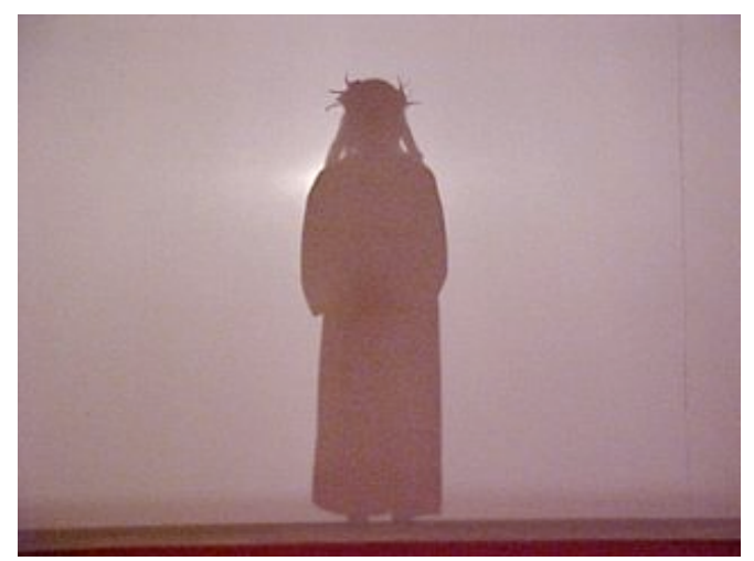
Scene 5: Jesus Carries His Cross Hymn "Beneath the Cross of Jesus" LBW No. 107 Text: John 19:16b-17