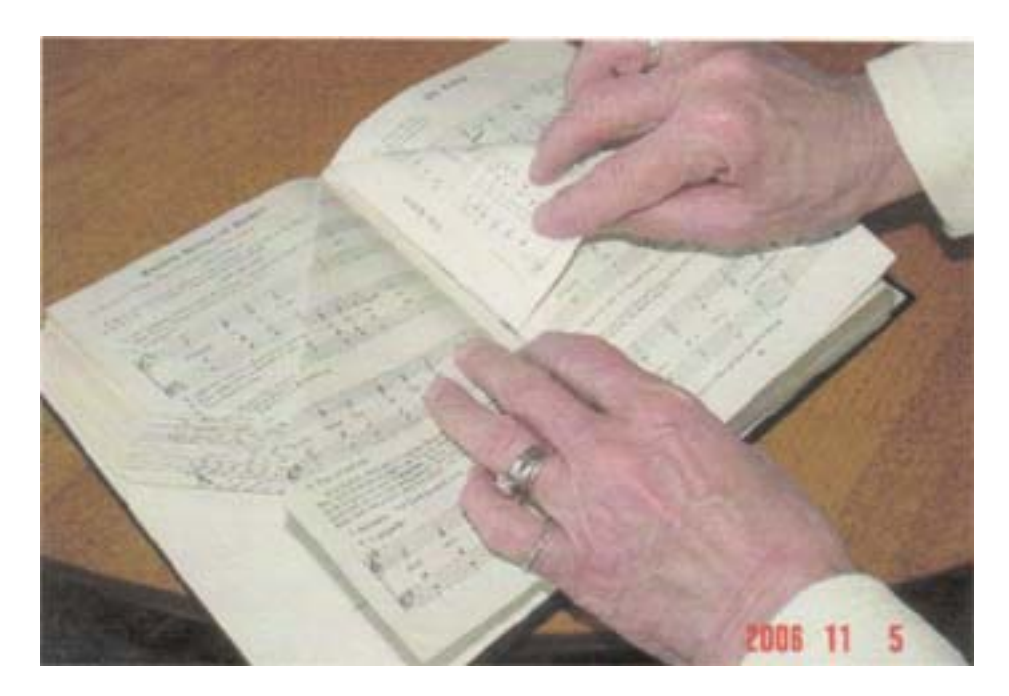
The makes the skirt of the Angel.

Fold remaining pages of the hymnal by taking by taking the upper right hand corner and folding in half with the upper right hand corner touching the center of the spine.